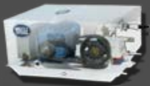
MME 86R ELECTRIC WATER CANNON