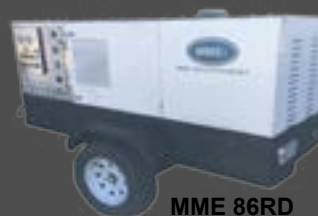
MME 86RD DIESEL WATER CANNON

Chartwell, Fourways, 2191 P.O. Box 3002, Dainfern, 2055